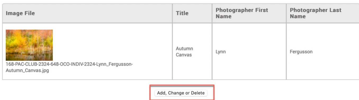
Figure 7 – Example of “Add, Change or Delete” appearing under all the successfully uploaded images. / Exemple de “Ajouter, modifier ou supprimer” apparaissant sous toutes les images téléchargées avec succès.

SPECIAL NOTE - Once the Upload progress bar has reached 100% then the “ Add, Change or Delete ” button appears at the bottom of the Upload window, as shown in Figure 7 below.